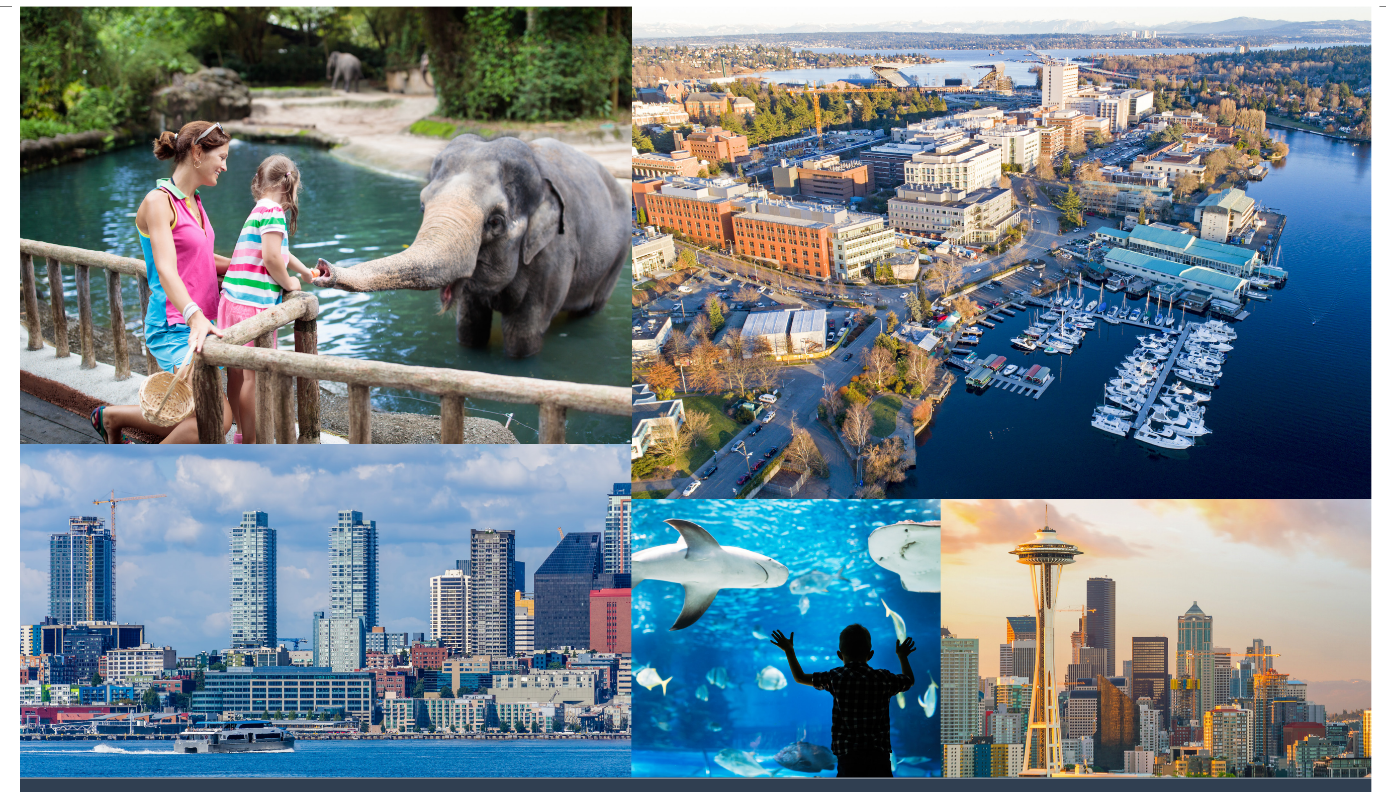
1000 1ST AVENUE, SEATTLE, WA 98104 HOTEL1000SEATTLE.COM