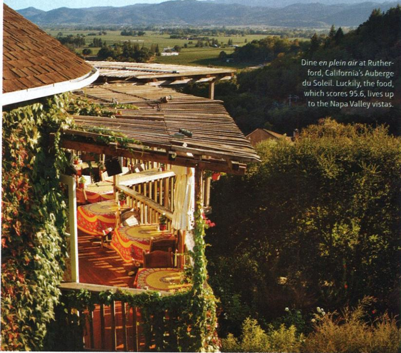
Dine en plein air at Rutherford, California's Auberge du Soleil. Luckily, the food, which scores 95.6, lives up to the Napa Valley vistas.

For full reviews of every hotel and resort on the 2011 Gold List, with reader quotes, go to cntraveler.com/goldlist . (Or download our soon-to-be-released iPhone or iPad app: Condé Nast Traveler's 2011 Gold List.)